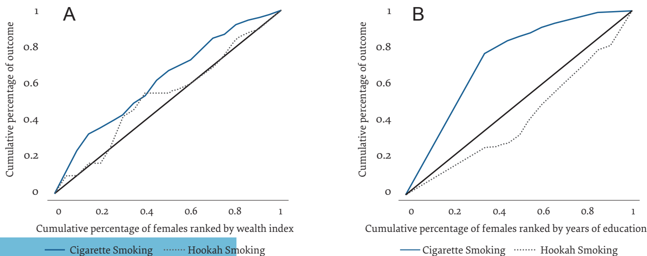
Figure 2 Concentration curve for cigarette smoking and hookah smoking among women based on wealth index (A) and educational attainment (years) (B).

Our results showed that alcohol consumption and hookah smoking were more prevalent among higher-SES men. We did not estimate socioeconomic-related inequalities for alcohol consumption for women because of the low number of alcohol users in the sample (4; 0.1 % of women). This finding is consistent with studies conducted in other countries. For example, Patrick and colleagues (24) suggested that there was a significant positive association between higher SES and alcohol consumption among young American adults after controlling for covariates. Another study by Charitonidi and colleagues (25) showed a positive association between SES and alcohol consumption in Switzerland.